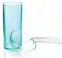
Measuring spoons set for alginates up to 48 hours