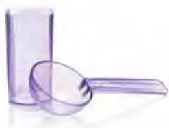
Measuring spoons set for alginates up to 5 days