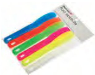
Fluorescent alginate spatulas (6 pcs)