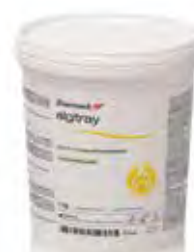
Algitray 1 kg

Find out more about related Zhermack preliminary impression products