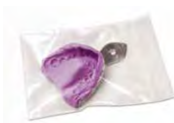
Long Life Bag, 1 pack contains 100 pcs (impression storage bags with airtight seal)