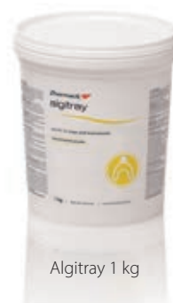
Algitray 1 kg