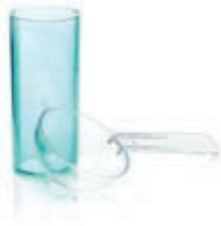
Measuring spoons set for 48-hour alginates