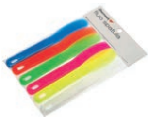
Fluorescent alginate spatulas (6 pcs)