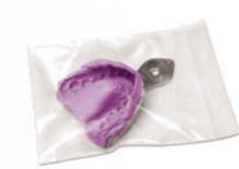
Long Life Bag, 1 pack contains 100 pcs (impression storage bags with airtight seal)