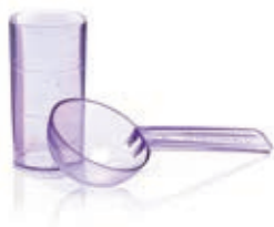
Measuring spoons set for 5-day alginates