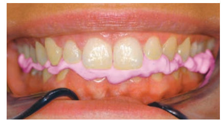
Complete colour change (pink)