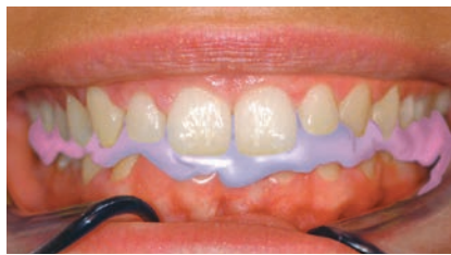
Setting phase (colour change from purple to pink)