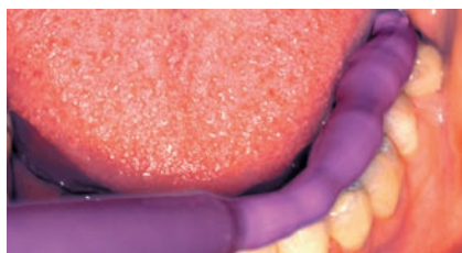
Application of OCCLUFAST ROCK (first phase)