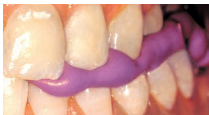
Bite registration (second phase)