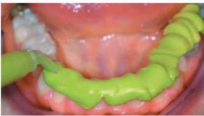
Application of COLORBITE D (green)

COLORBITE D is green at room temperature and becomes yellow at 35°C in the mouth to indicate that setting is complete.