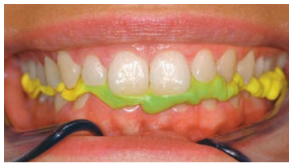
Setting phase (colour change from green to yellow)