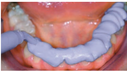
Application of COLORBITE ROCK (purple)

COLORBITE ROCK is purple at room temperature and becomes pink at 35°C in the mouth to indicate that setting is complete.