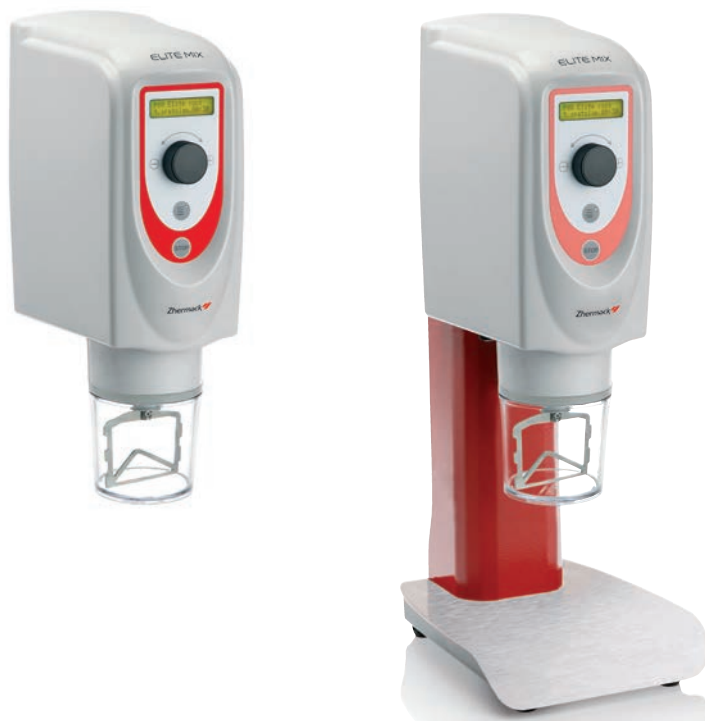
Bench mounted with stand (optional)