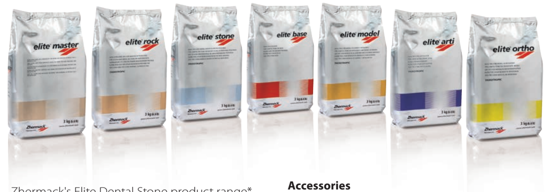
Zhermack's Elite Dental Stone product range*